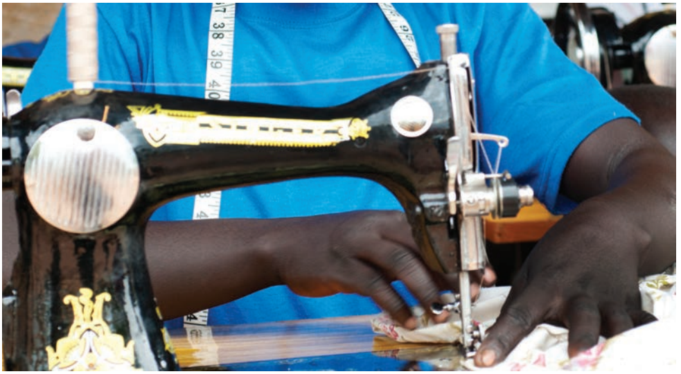
Sewing Machine; Baobab