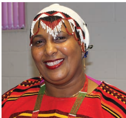
Makita: Tasting My Future

Find out more at www.tastingmyfuture.net